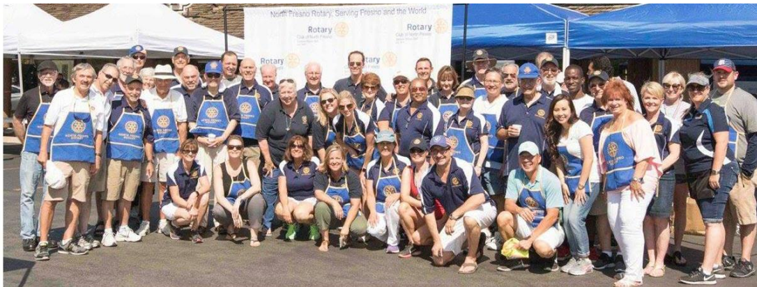
North Fresno Rotary Members

North Fresno Rotary presents our 2019 Pancake Breakfast leaders.