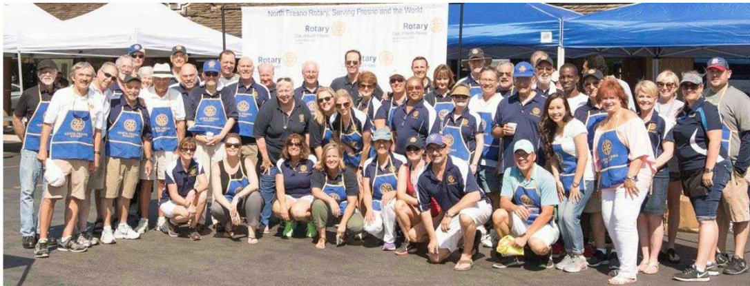
North Fresno Rotary Members

North Fresno Rotary presents our 2019 Pancake Breakfast leaders.