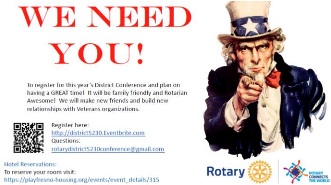
Rotary 5230 Conference