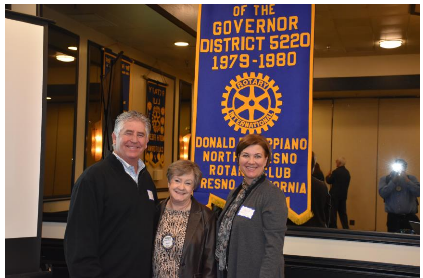
Wings of Fresno

The Rotary Club of North Fresno is a volunteer organization whose members take action to create sustainable change in our community and around the world